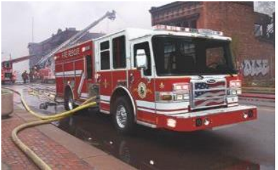
Fire & Emergency